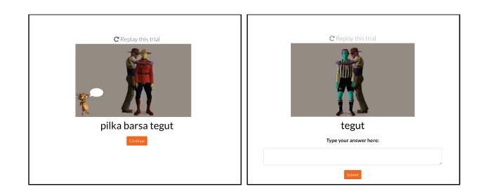
Figure 1: Examples of sentence exposure (left) and sentence production (right) trials. Pictures represent still images of the videos participants saw. The alien informant was present in each sentence-exposure video but absent during sentenceproduction trials.

Participants were instructed that they would be learning an "alien" language by watching short videos and hearing sentences describing them produced by an alien informant. The language contained four nouns that corresponded to humanoid referents (CHEF, MOUNTIE, REFEREE, BANDIT), two transitive verbs (KICK and HUG), and a case suffix "-dak" that (if present) attached to the object of the verb. The language was presented both auditorily and in writing; participants produced language by typing.