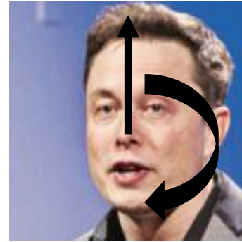
Figure 3. The map to V1 starts at the vertical meridian and proceeds clockwise from there.

For our model, we have chosen to simplify Polimeni’s model map to the visual cortex in two ways. The first is in the visual cortex itself. Instead of mapping to V1, V2, and V3, we are only concerned with primary visual cortex (V1). Our focus is on studying the mapping from the visual field onto the visual cortex as a possible factor in the explanation of the face-inversion effect. Because of this, we do not model the mapping of the visual field onto higher visual areas, nor did we model anatomically where the stimuli are