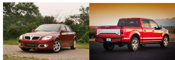
Figure 5. Images from The Comprehensive Cars Dataset