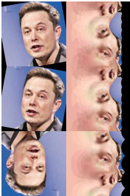
Figure 2. Rotation is a vertical translation

the visual field onto a 2D representation of cortical space. In this map, a wedge map is a compression of the image in the visual field along the azimuth, and the conformal dipole mapping “is an extension of the standard log-polar or complex logarithm mapping” (J.R. Polimeni et al., 2006).