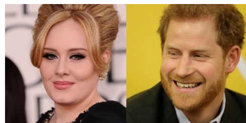
Figure 4. Images from face dataset

In the rotation experiment, we rotated the training images to commonly observed head orientations: 20^\circ , 10^\circ , 0^\circ , -10^\circ , and -20^\circ . To study the face inversion effect, we also rotated testing images to 180^\circ for testing (not included in training). For each case of rotation, we first found a bounding box around the face and then took the log polar transformation from the center of the face, similarly to the scaled images. After the images have undergone a log polar transformation,